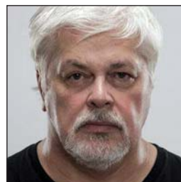
Cpt Paul Watson