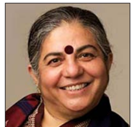
Dr Vandana Shiva