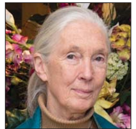
Dr Jane Goodall